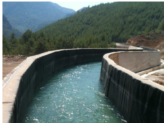
Turkey, Akfen Anamur calan, 3.000 m 2 , 2015 Hydropower canal