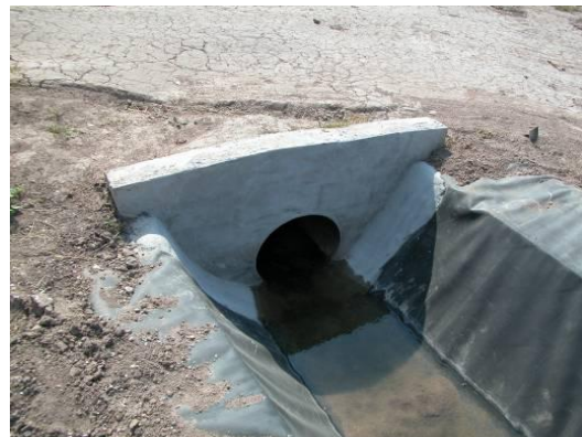
USA, Hidalgo Irrigation District #1, February 2002 Irrigation canal