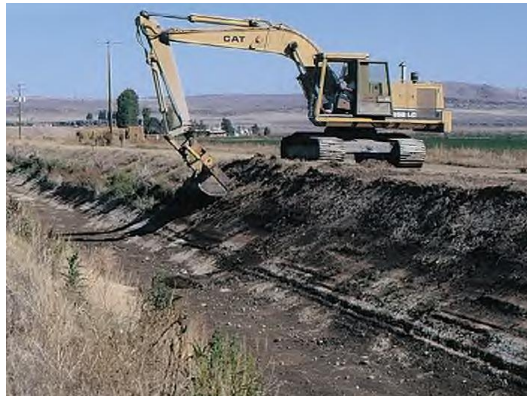
USA, Tulelake Irrigation District, 3.7 km, 2002 Irrigation canal