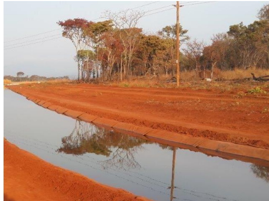
Tanzania, Ndolela African Plantation, 7 km, 2016 Irrigation canal