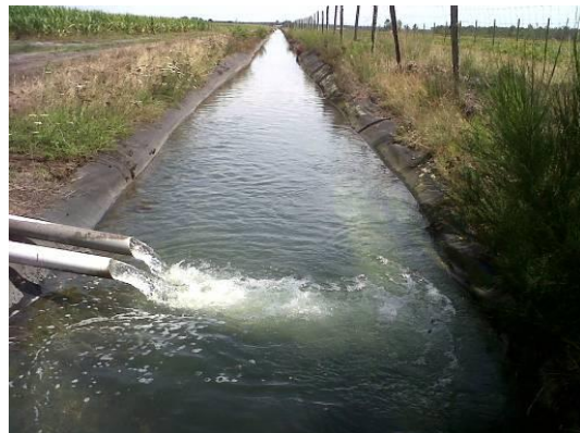
France, Canal Landes, 2 km, 1994 Irrigation canal