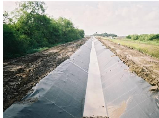
USA, Harlingen (Texas) Irrigation District, 14.600 m 2 , 2003 Irrigation canal